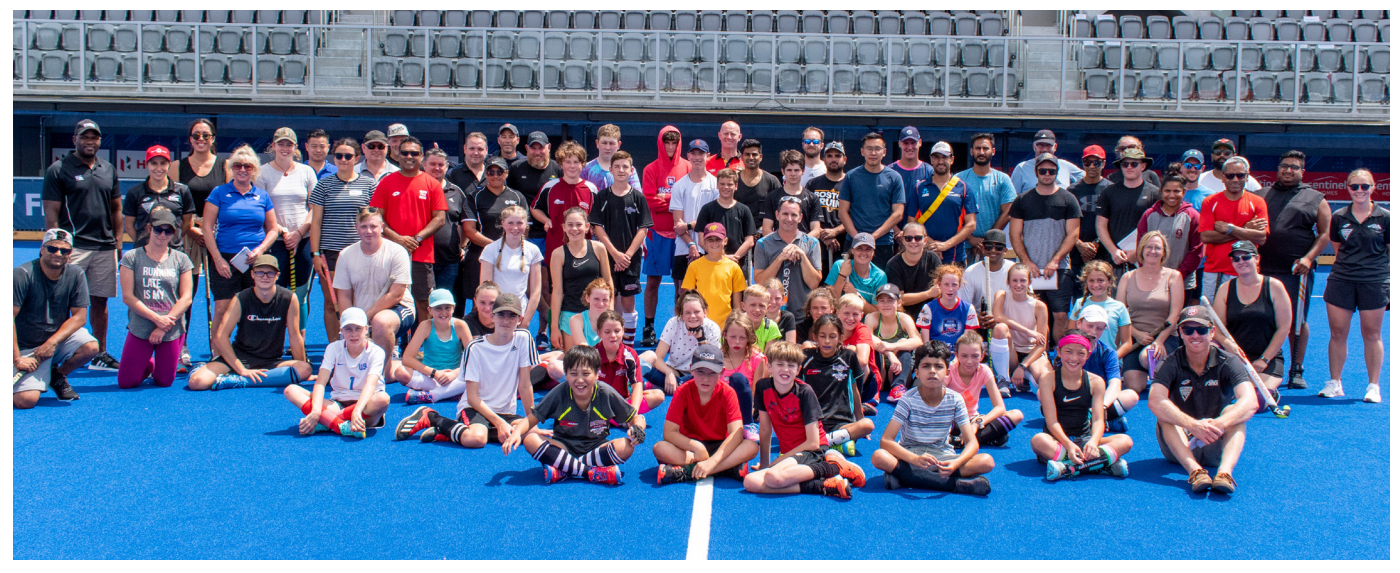
Participants at the FIH Level 1 Coaching Course held at the National Hockey Centre at North Harbour in February.

Hockey NZ and Association coach development activities were affected by the global Covid-19 pandemic. This is reflected in the reduced number of workshops delivered.