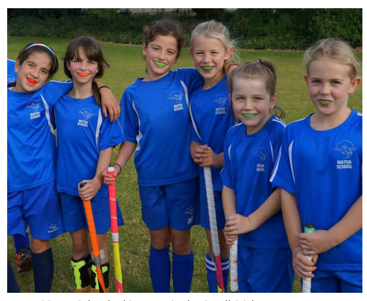
Matua School taking part in the Small Sticks programme delivered by Tauranga Hockey Association