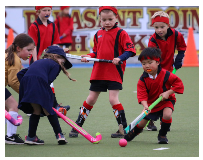
Children in South Canterbury participating in the Small Sticks programme.