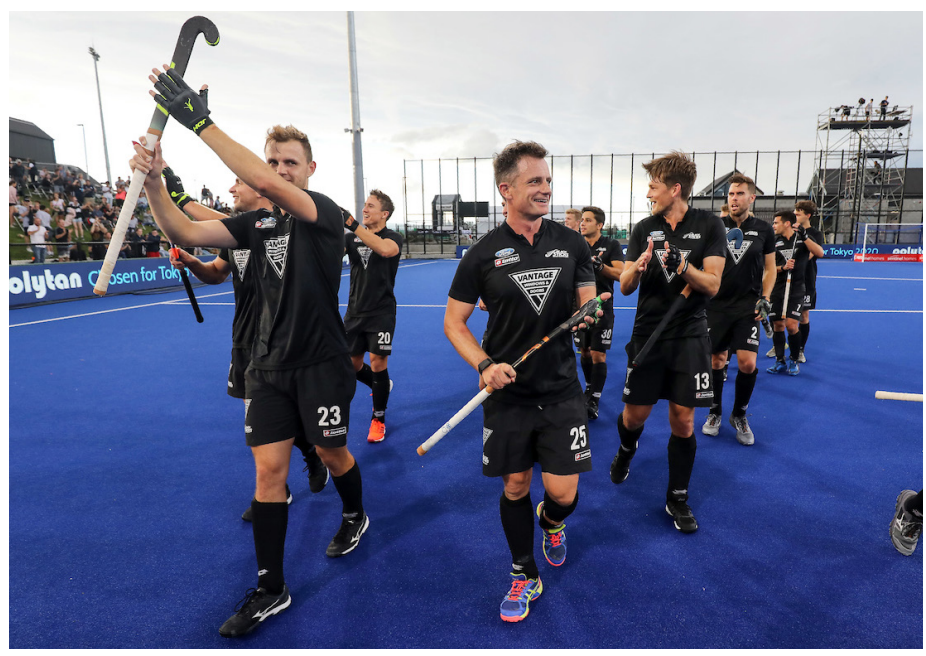
Vantage Black Sticks Men thank the crowd after a 5-3 win against Argentina in Christchurch in February.

Despite a disrupted year, we managed to broadcast 60 matches in 2020. We began with 16 home matches for the Vantage Black Sticks men and women in the FIH Hockey Pro League live on Spark Sport, followed later in the year with 16 Secondary School matches in the revised regional competition, and finished with 28 matches of the Sentinel Homes Premier Hockey League.