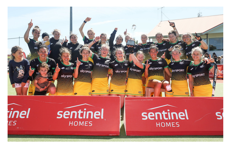
Central Falcons Women celebrate their league victory in Hamilton.

the teams were level at 1-1 at fulltime.