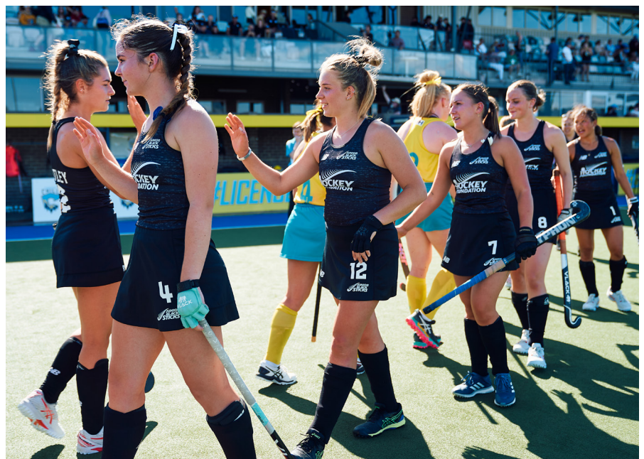
Members of the Junior Black Sticks women's squad prior to their Trans-Tasman clash against Australia