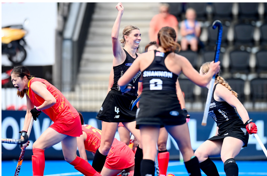
Olivia Merry celebrating a goal scored at the Women's World Cup vs China.