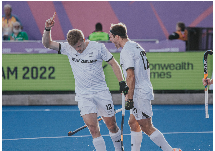
The Vantage Black Sticks men celebrating a goal scored at the 2022 Birmingham Commonwealth Games.

After a dominant win against Pakistan, and a loss to Australia, the team required a win in their final pool match