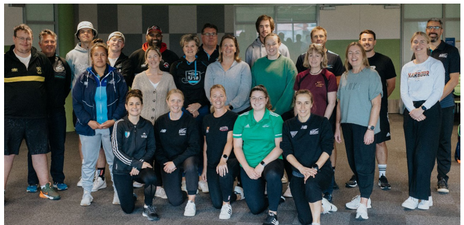
Participants at an association induction workshop with a focus on coaching and inclusion streams

Outside of New Zealand, Oceania Hockey led an online FIH Developer course. Facilitated by Hockey NZ and Hockey Australia Trainers, participants from Australia, New Zealand and Vanuatu, came together to learn and share knowledge, and gain their internationally recognized Developer accreditation.