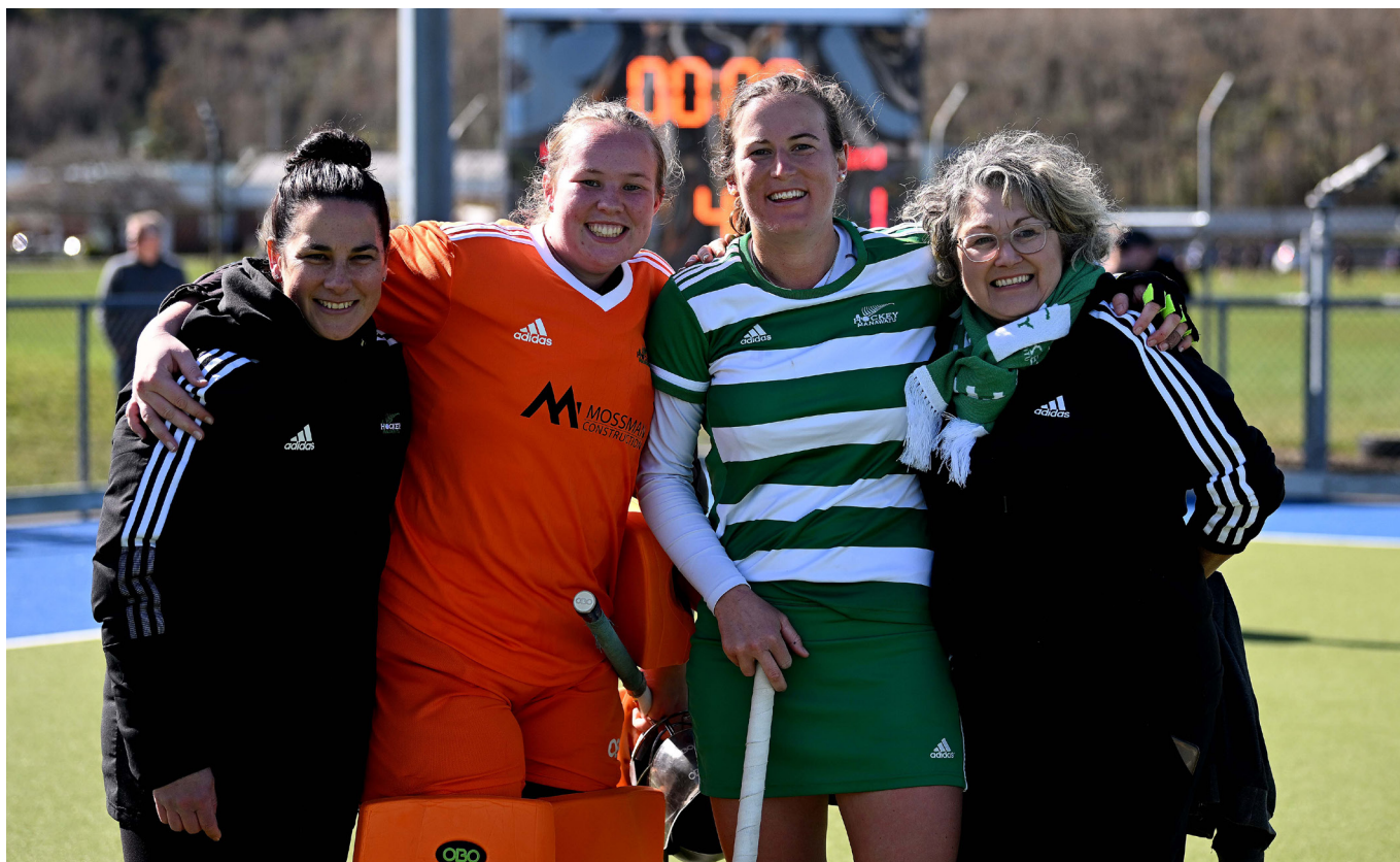
Members of the Manawatu women's team at the Ford National Hockey Championships in Dunedin.